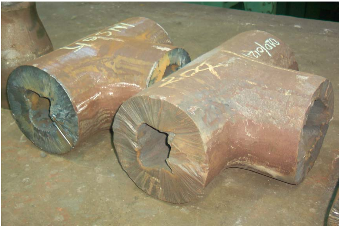
5. Ø 219mm 'T' fitting