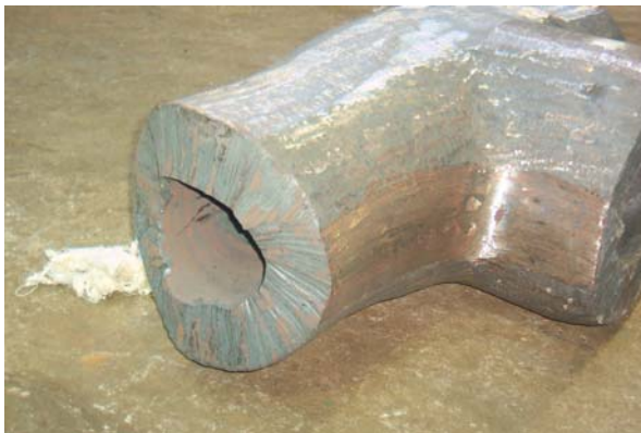
8. Run end of Unequal 'T' fitting