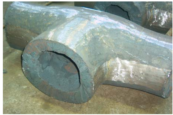
9. Branch end of Unequal 'T'