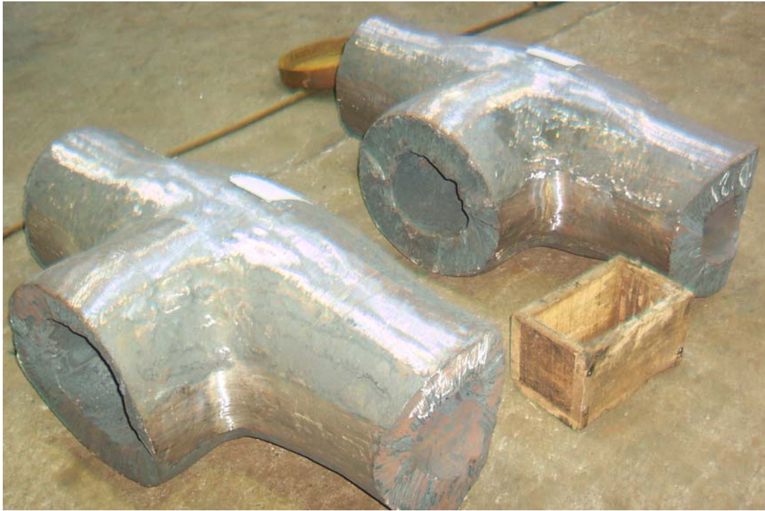
7. Unequal 'T' fitting