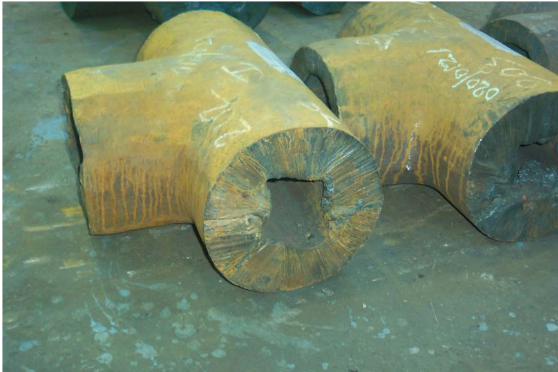
1. Ø219mm Formed 'T' Fittings