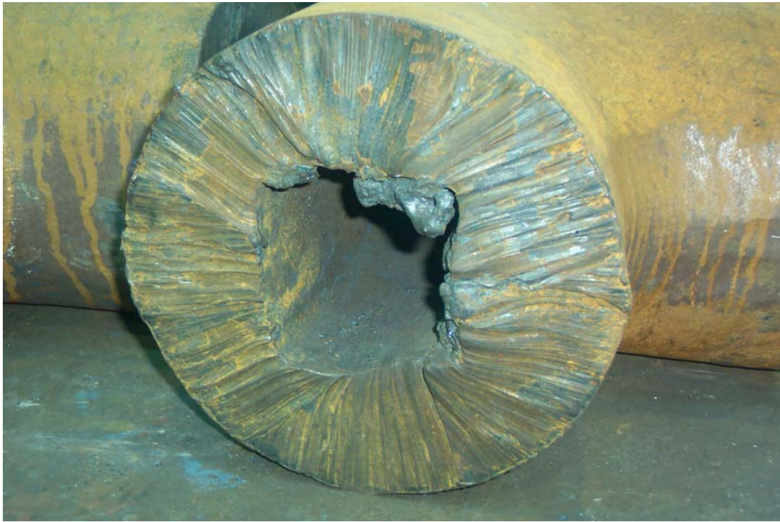
3. One end of 'T' fitting - Closer View