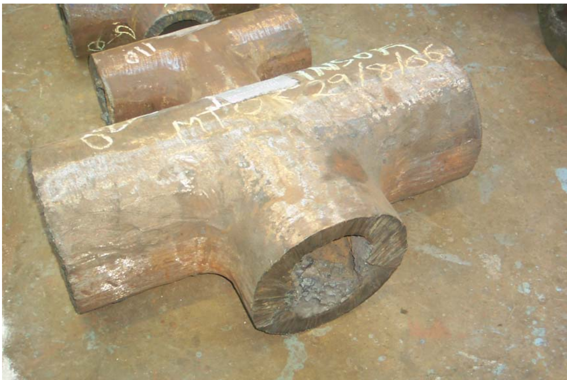
6. Ø 273mm 'T' fitting