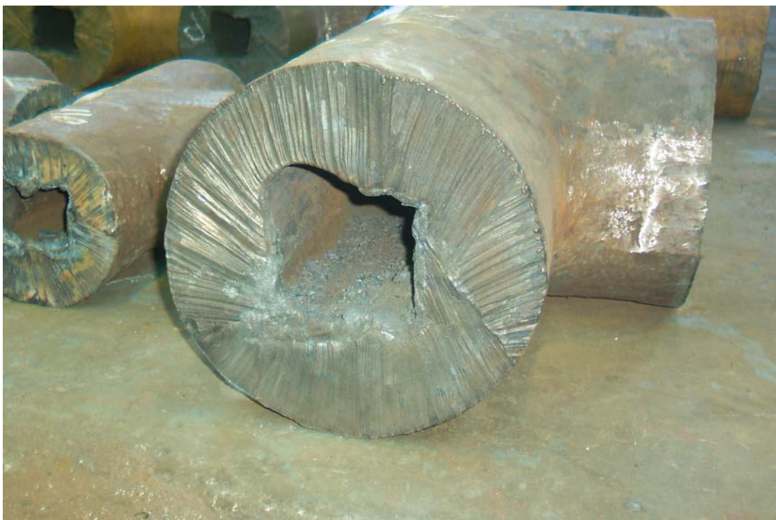
4. Ø 273mm 'T' fitting