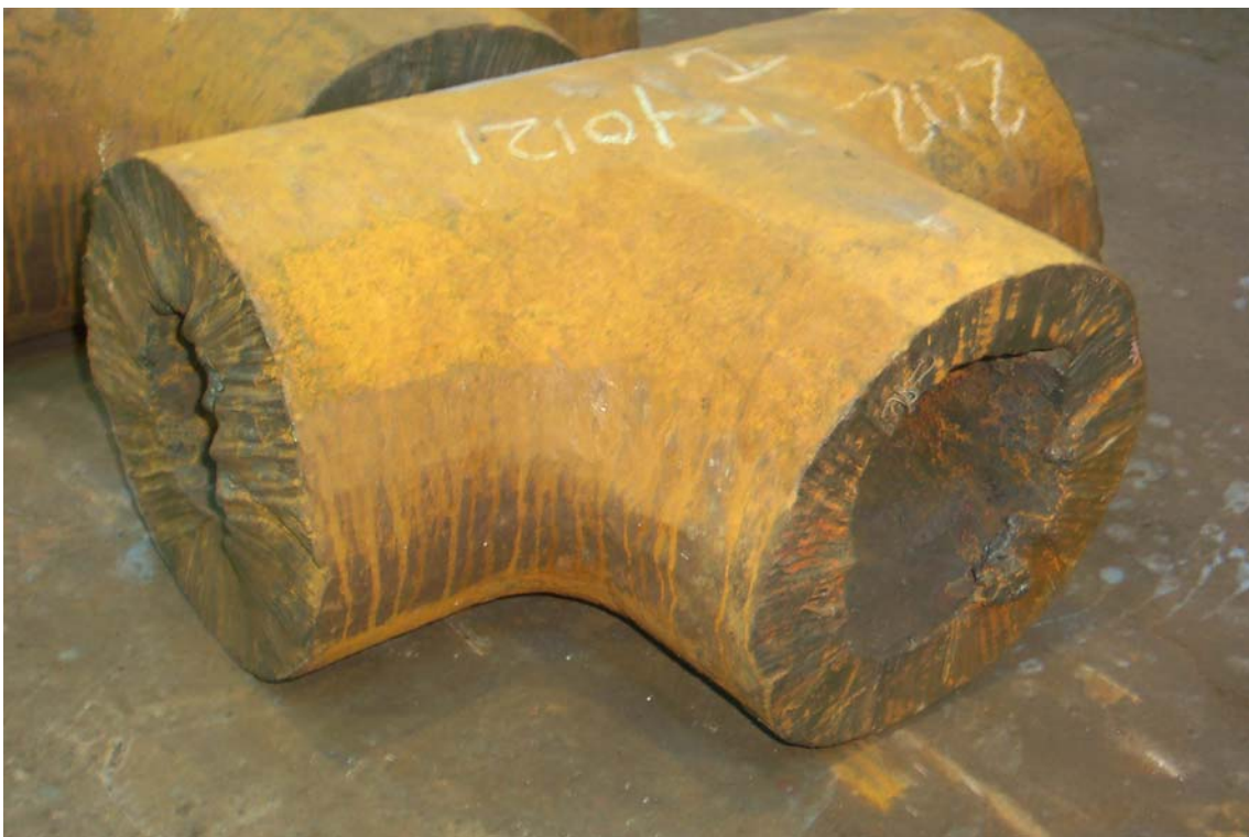
2. Ø219mm Formed 'T' Fittings